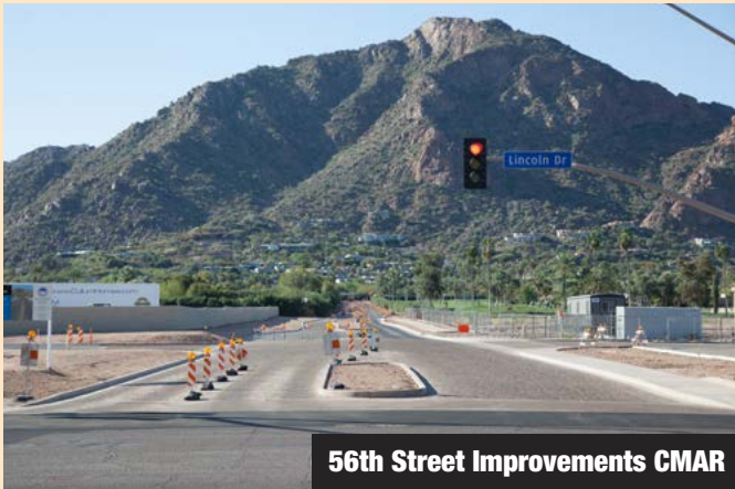
56th Street Improvements CMAR

While Spring Training and March Madness are in full effect, Achen-Gardner is hard at work improving roadways and wet utility infrastructure throughout Arizona. Here are a couple of projects we are currently working on during this beautiful time of year.