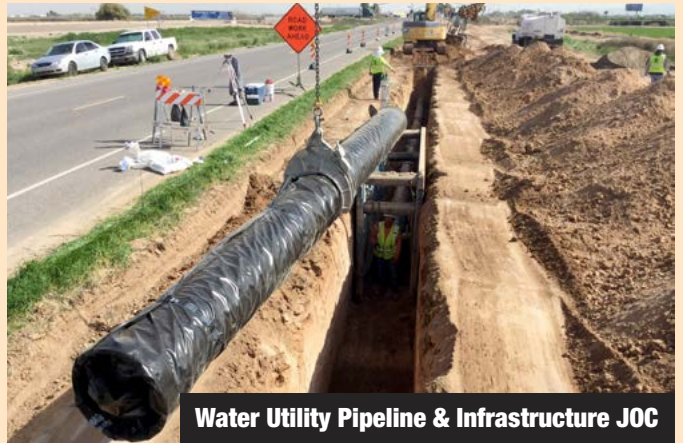
Water Utility Pipeline & Infrastructure JOC

The scope of work on the 56th Street Improvements CMAR for the Town of Paradise Valley consists of the reconstruction of 56th Street between McDonald Drive to Lincoln Drive and includes removals, grading, 6,817 square yards of asphalt paving, concrete flatwork, sewer modifications, pathway lighting, 11,930 square feet of roadway pavers, traffic signals, signing, striping, and custom aesthetic site amenities providing a pedestrian node with shade, pavers, and seating. [See more photos on our Facebook page] [See project information and photos on our website]