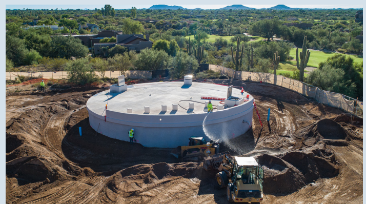
Construction of the new 300,000 gallon concrete reservoir.