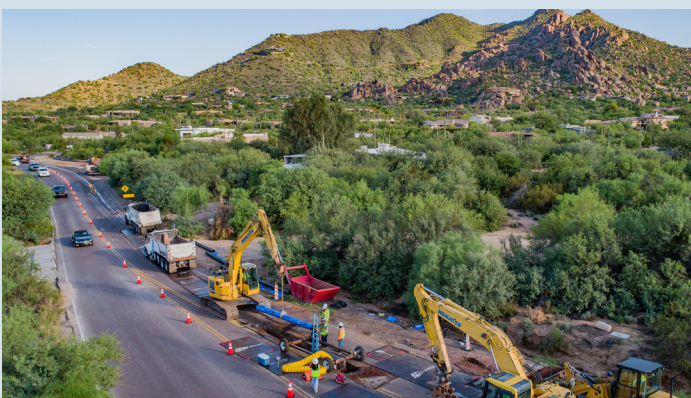
We installed more than 24,000 LF of waterline and 40 valves.